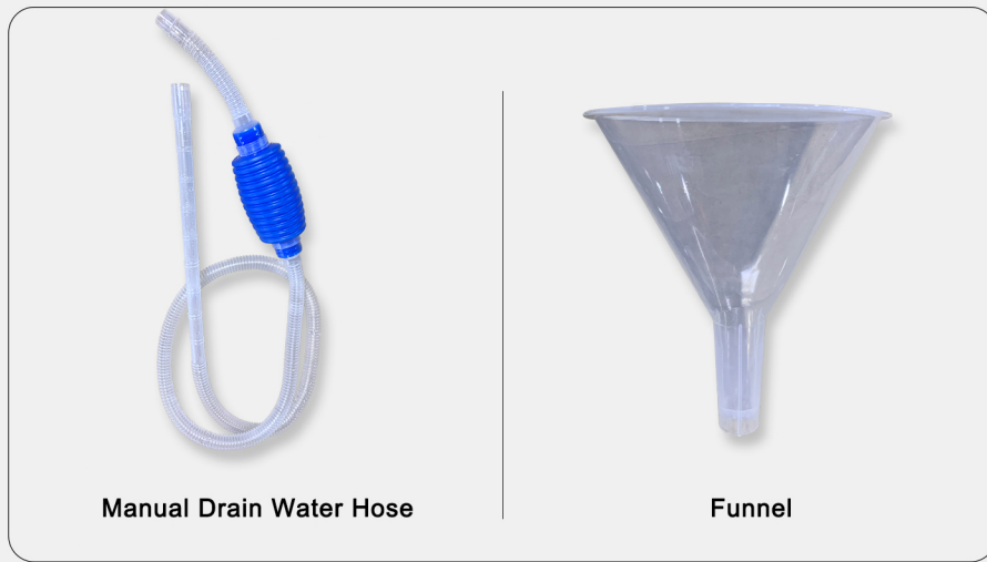
Manual Drain Water Hose